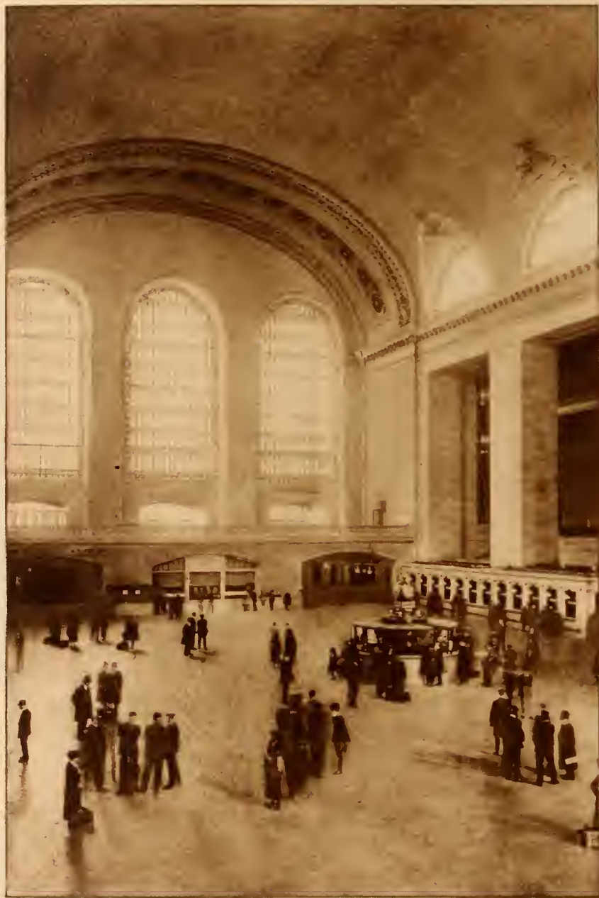
INTERIOR OF THE GRAND CENTRAL STATION. At certain times of the day the station is crowded by more than twenty thousand people.